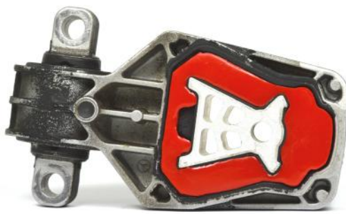
Figure 1 - showing polyurethane insert fitted inside the lower engine mount